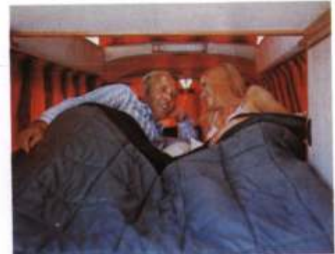
Extend the rear berth and it becomes an adult double.