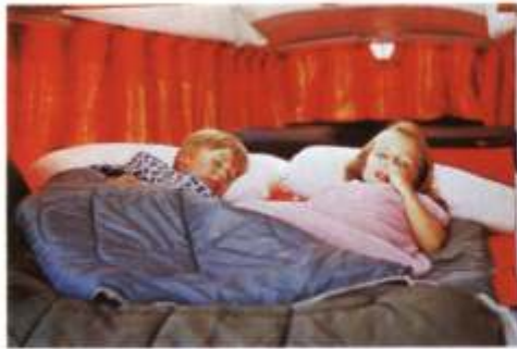
Rear double berth for children.