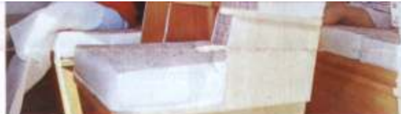
Large and comfortable reversible seating is seen here facing forward for travelling.