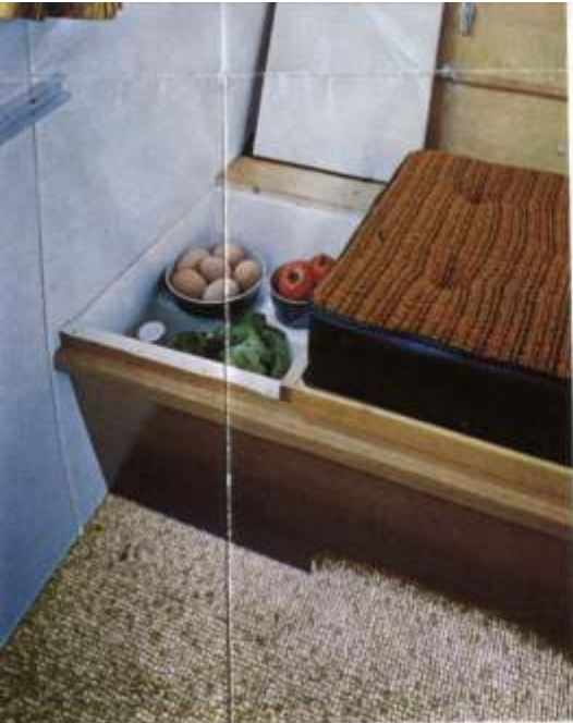
The handy hideaway insulated food store, as fitted on the Sunlander Kombi.