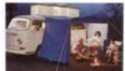
The advantages of a completely automatic side opening need no explanation. Just one of the many available extras.