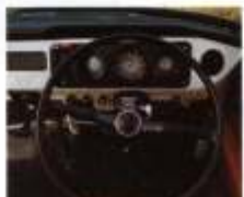
All the standard VW features, built on a shared steering wheel and easy-to-use instruments. It adds up to more relaxed driving.