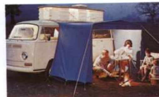
The advantages of a completely enclosable side awning need no explanation. Just one of the many available extras.