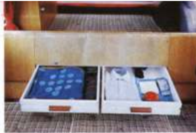
Compact pull-through drawers come from behind centre seat cushions. Elevating roof, with the single berths stowed away, provides full headroom even for a six-footer. Shown here is the Sunlander Microbus conversion.