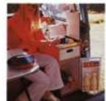
The convenient sink, roof support and storage storage unit in the Mountain.