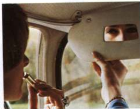
Little things mean a lot, so they are provided in the form of vanity mirrors, safety door locks, coat hooks, and sunvisors.