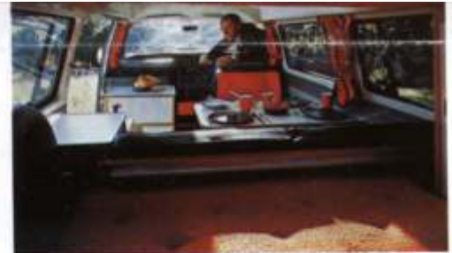
The comfortable children's double bunk, table layout and conveniently stored cooker in the Moonraker on Microbus.