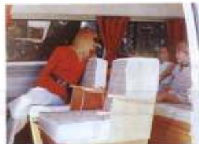
Large and convenient to reversible seating is seen here facing forward for travelling.