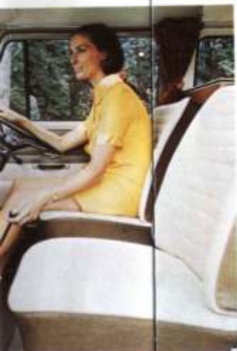
Seat, adjustable to 9 positions with back rest, provides constant driving comfort. Water is a standard fitting. Wide screen and air-flow give a feeling of freedom throughout.