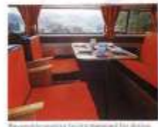
Reversible seating facing forward for dining.