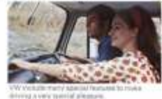
VW's vehicle safety system features to make driving a very special pleasure.