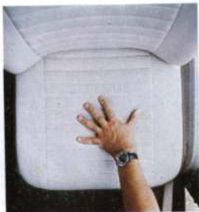
Super-soft upholstery, combined with superb VW suspension, guarantee a smooth ride across the roughest terrain. Front disc brakes provide extra safe braking power.