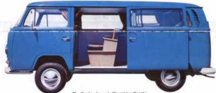
The Sunlander on brilliant blue Kombi

With a Devon Motor Caravan you can take the whole family anywhere, anytime, just when you feel like it. You come and go as you wish. And remember you have no hotel accommodation to pay for. Devon build their conversions on both Volkswagens's Microbus and Kombi (adding their own Devon craftsmanship to the already well known quality). So you can start to suit your pocket even before you decide which of the two conversions you will prefer. You can therefore choose between the Sunlander or the Moonraker on VW Microbus or Kombi. Both conversions provide comprehensive facilities. You have everything you need to be your own boss, and many optional accessories, such as elevating roof with two extra bunks. The Sunlander or the Moonraker on Microbus come in white or two tone: white/Niagara blue, white/siena yellow or white/chianti red.