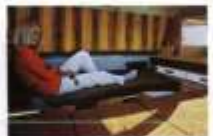
The seating arrangement is quickly altered to face two large single seats with the small double undisturbed at the rear. Add an slaying seat and the whole snug interior accommodates four adults and two children. (Surflander or Kombi).