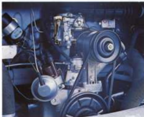
The air cooled, 1.6 litre, 4 cylinder, 57 bhp VW engine with low maximum revs and special oil cooler for speed without strain gives you 27 mpg which is real economy.