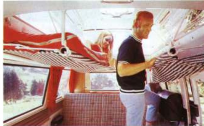
The two extra full length adult bunks in position when roof is elevated.