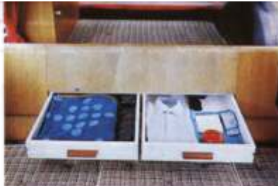
Compact pull-through drawers come from behind centre seat cushions. Elevating roof, with the single berths stowed away, provides full headroom even for a six-footer. Shown here is the Sunlander Microbus conversion.