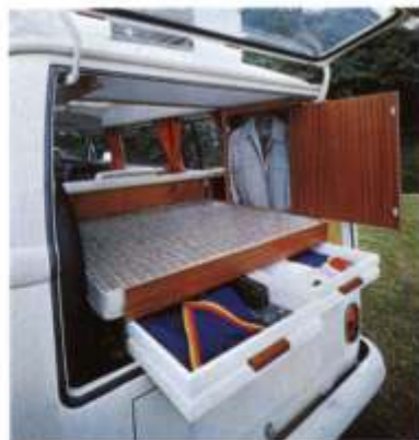
Pull-through drawers extended to rear. Showing children's bunk and deep wardrobe.