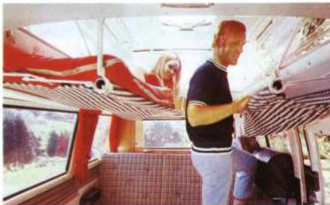
The two extra full length adult bunks in position when roof is elevated.