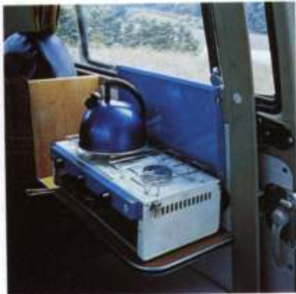
Simply remove plastic cover and the cooker is ready for use with two burners and compact low level grill. (Sunlander).