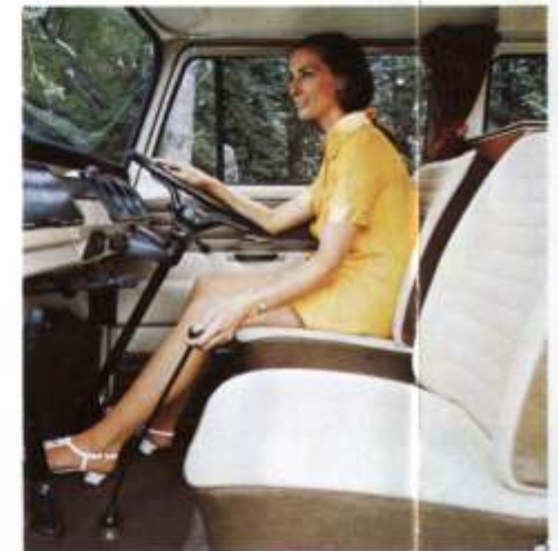
The driver's seat, adjustable to 9 positions with a variable back rest, provides constant driving comfort. A heater is a standard fitting, and the extra-wide screen and air-flow ventilation give a feeling of freedom throughout the journey.