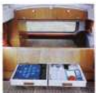
Compact lock-through drawers come from behind and the seat cushions slaying seat, with the single lock-through seats, provides full headroom even for a six-footer. Shown here in the Surflander Mountain version.