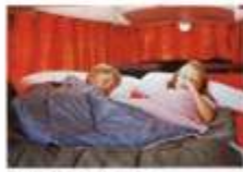
Two double seats for sleeping.