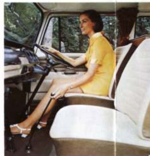
The driver's seat, adjustable to 9 positions with a variable back rest, provides constant driving comfort. A heater is a standard fitting, and the extra-wide screen and air-flow ventilation give a feeling of freedom throughout the journey.