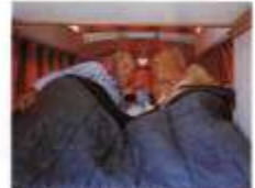
Extend the rear bench and it becomes an extra double.