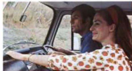
VW include many special features to make driving a very special pleasure.