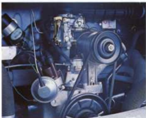
The air cooled, 1.6 litre, 4 cylinder, 57 bhp VW engine with low maximum revs and special oil cooler for speed without strain gives you 27 mpg which is real economy.