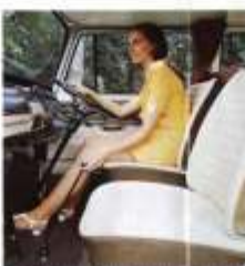
The driver's seat adjustable to 8 positions with a variable back rest, provides excellent driving comfort. A feature to a standard fitting, and the seat-wide correct and on-line, ventilation give a feeling of freedom throughout the journey.