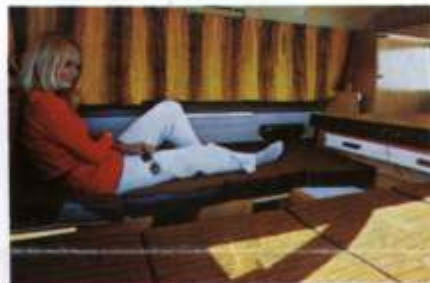
The seating arrangement is quickly adapted