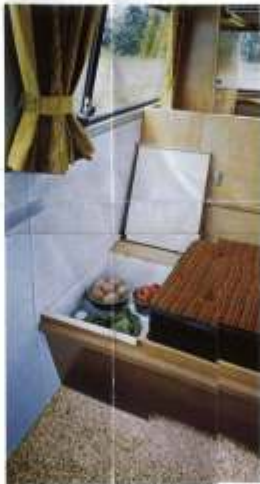
The handy, fullyway insulated food store, up to 100 o in the Surflander Kombi.