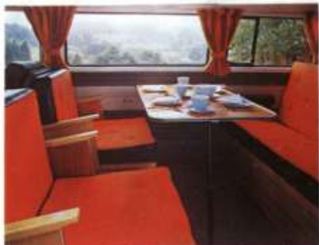
Reversible seating facing rearward for dining.