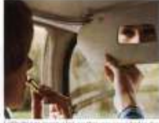
Little things make a lot, so they are provided in the form of safety mirrors, safety door locks, seat belts, and sunvisors.