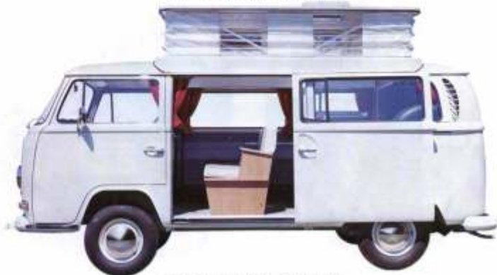
The Sunlander on pastel white Microbus

The lower priced Kombi, basically similar to the Microbus, is available in white, brilliant blue or chianti red. Devon Motor Caravans are in a class of their own because the conversion work is the best you can buy. Finest quality timber is used throughout and the whole construction is hand-finished. It's worth the extra to know the journey's end will be as comfortable as the journey itself. And with any model you can have such extras as CAB-centre seat, retractable side step, window fly screens, completely enclosable side awning and roof-lifted elevating roof with two full length adult bunks. Shown below is the roof in its raised position.