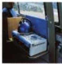
Gas, remote power, cover and the cooker is ready for use with two burners and compact low level grill. (Surflander).