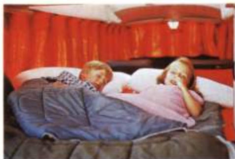
Rear double berth for children.