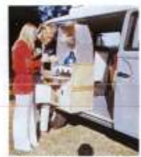
In the Mountain the cooker has extra storage space and insulation. The convenient swing ledge draping lid is appreciated for cooking, Alfredo, and becomes perfectly suited for use when outside evening is lit.