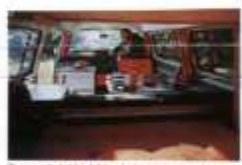
The convenient chin-down stove base, table legs and conveniently stored cooker in the Mountain (in the Kombi).