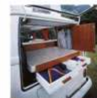
Full-through drawers extended to rear. Showers children's bath and deep washbasin.