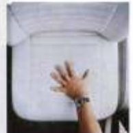
Super soft upholstery combined with superb VW suspension guarantees a superb ride across the roughest terrain. Power disc brakes provide soft left braking power.