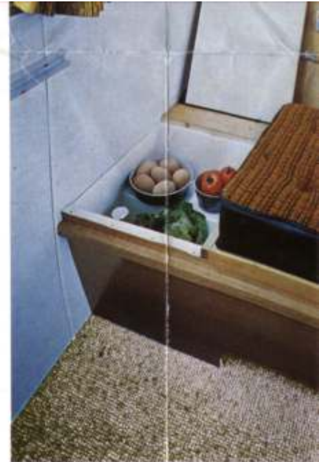
The handy hideaway insulated food store, as fitted in the Sunlander Kombi.