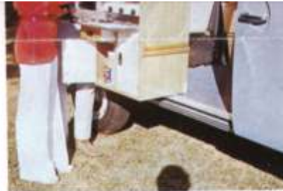
In the Moonraker the cooker has extra storage space and windshield. The convenient swing hinge mounting will be appreciated for cooking 'alfresco' and becomes perfectly situated for use when outside awning is fitted.