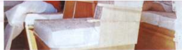
Large and comfortable reversible seating is seen here facing forward for travelling.