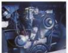
The air-cooled, 1.8 liter, 4 cylinder, 17 hp VW engine with low maintenance, new and special oil cooler for speed without extra power plus 27 mpg which is real economy.