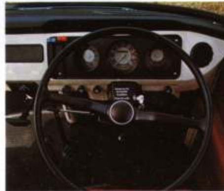
All the standard VW features, such as dished steering wheel and easy-to-see instruments, that add up to more relaxed driving.