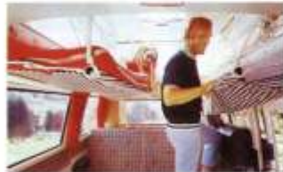
The two extra full length adult bunks in position when roof is lowered.