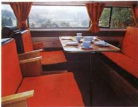
Reversible seating facing rearward for dining.