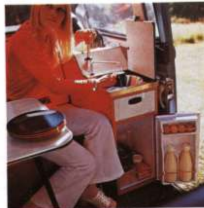
The compact sink, cool cupboard and crockery storage unit in the Moonraker.