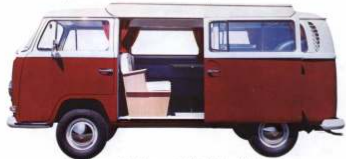
The Devon Sunlander on pastel white/chianti red Microbus

(Devon motor caravans make every weekend a holiday)