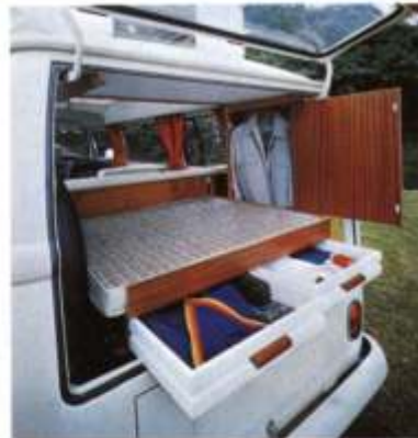
Pull-through drawers extended to rear. Showing children's bunk and deep wardrobe.