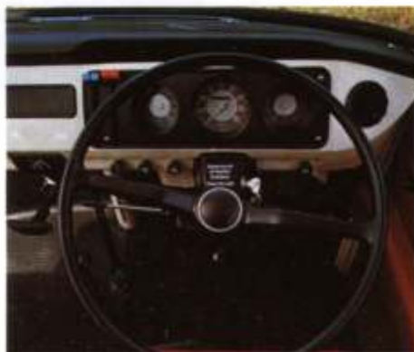
All the standard VW features, such as dished steering wheel and easy-to-see instruments, that add up to more relaxed driving.