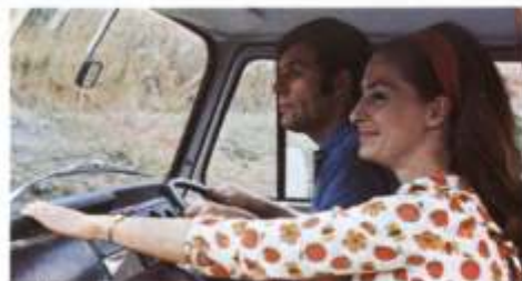
VW include many special features to make driving a very special pleasure.