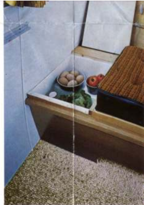
The handy hideaway insulated food store, as fitted in the Sunlander Kombi.